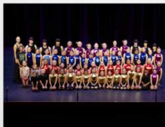
2023 END OF YEAR SHOW

There is a End of Year Show fee of $80 per dancer doing one class per week.